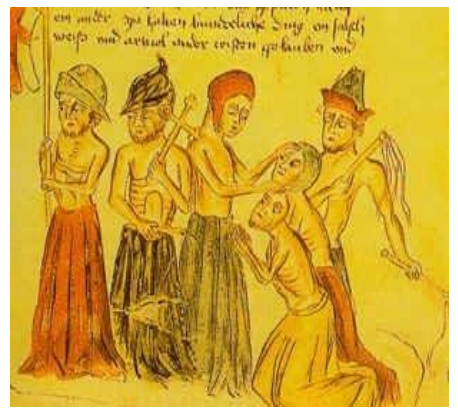
The Black Death Strikes

In about 1343 the Black Death struck the British Isles, brought here by fleas on Black Rats. This plague,