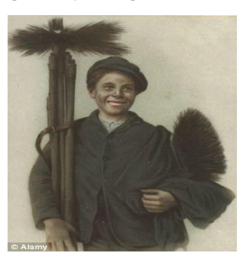
19th Century Sweep's Boy

In parts of Hertfordshire for instance, girls and boys may have started their working lives aged eight or nine tears of age. Girls may have been working at silk mills as silk throwers while boys may have started as farm boys or even worse as a chimney sweeps boy. The overcrowding and housing was particularly bad in parts of Hitchin